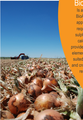
BioAg treated onion crops South Australia