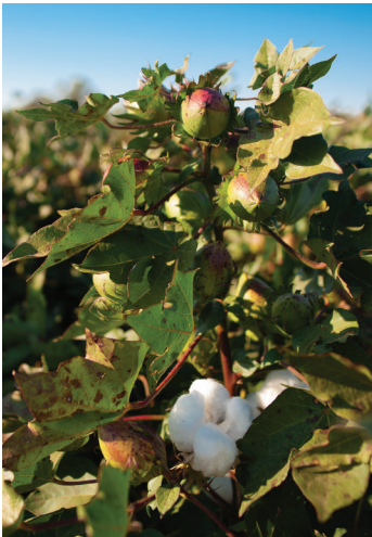
BioAg treated cotton crops Riverina/MIA, NSW