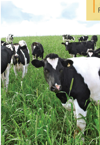
BioAg treated dairy pastures Victoria