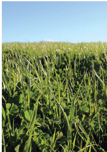
BioAg treated pastures South west slopes, NSW

OUR PRODUCTS AND PROGRAMS DELIVER HEALTHY, LIVING, BALANCED SOILS AND SUSTAINED FARMING PRODUCTION.