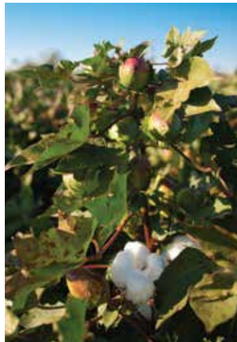
BioAg treated cotton crops Riverina/MIA, NSW

OUR PRODUCTS AND PROGRAMS DELIVER HEALTHY, LIVING, BALANCED SOILS AND SUSTAINED FARMING PRODUCTION.