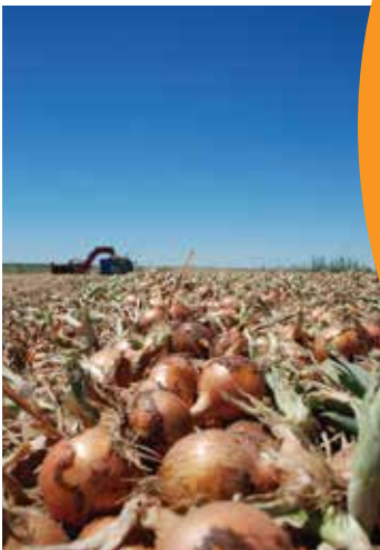
BioAg treated onion crops South Australia