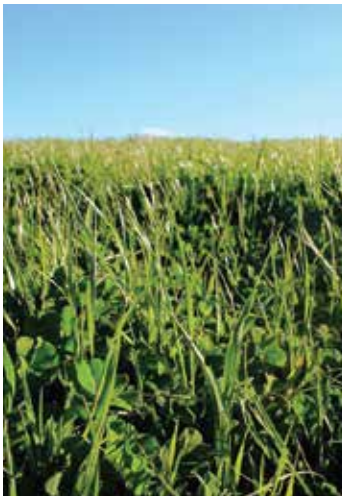
BioAg treated pastures South west slopes, NSW