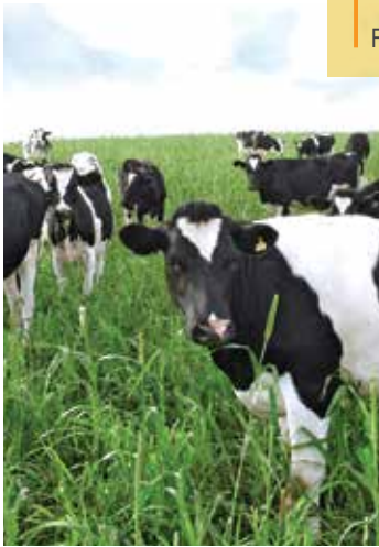
BioAg treated dairy pastures Victoria